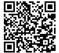
I Will Follow